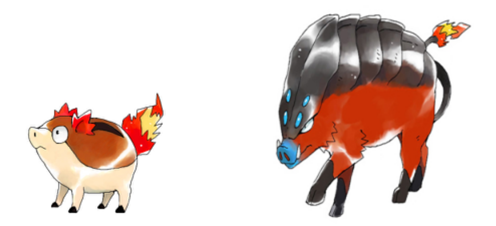
Figure 1: An example of visual stimuli. Left, pre-evolution character; right, post-evolution character.

characters are generally larger, they were about 1.5 times larger than the pre-evolution versions. An example pair of the visual stimuli is given in Figure 1. These visual stimuli were drawn by a digital artist, toto-mame , whose Pokémon pictures are judged to be very authentic by Pokémon practitioners.<sup>6</sup>