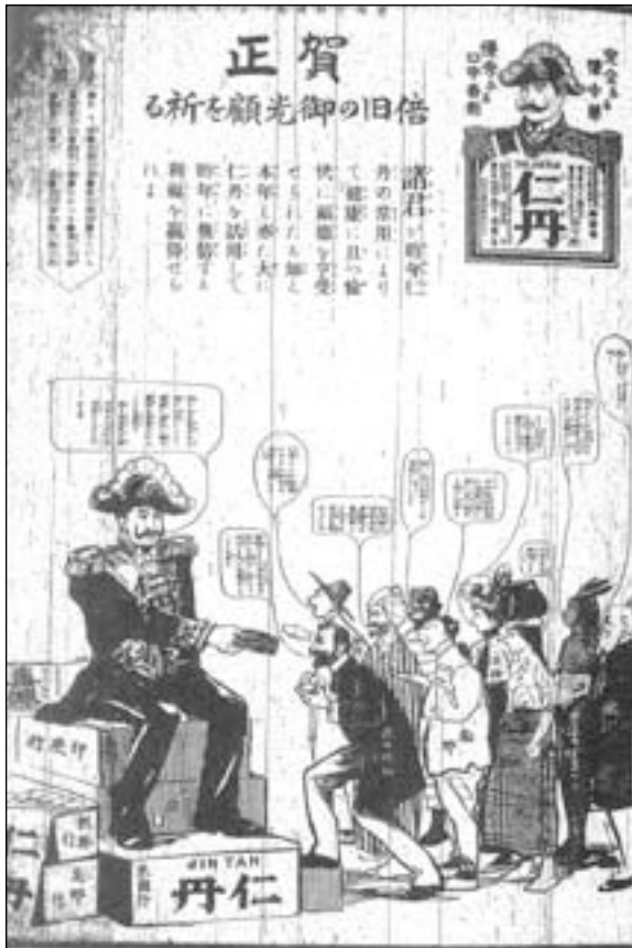
Figure 9. Jintan newspaper advertisement (Machida Shinobu, Jintan ha, naze nigai [n.p.: Borantia Jōhō Nettowōku, 1997], 15). Used with permission.

print the slogan “the pocket medicines of PhDs” ( hakase no kaichūyaku ), suggesting that the country’s intellectual elite made frequent use of Jintan’s invigorating properties. 38 As in the Dokumetsu campaign, newspaper ads for Jintan framed the trademark with text that cited the names of prestigious doctors who had embraced the new product.