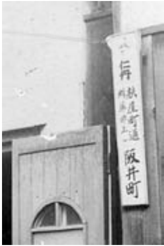
Figure 8. Jintan street sign.

leading physicians associated with the best hospitals and the universities of the country, was a modern, efficient, and rational means to achieve a cure.