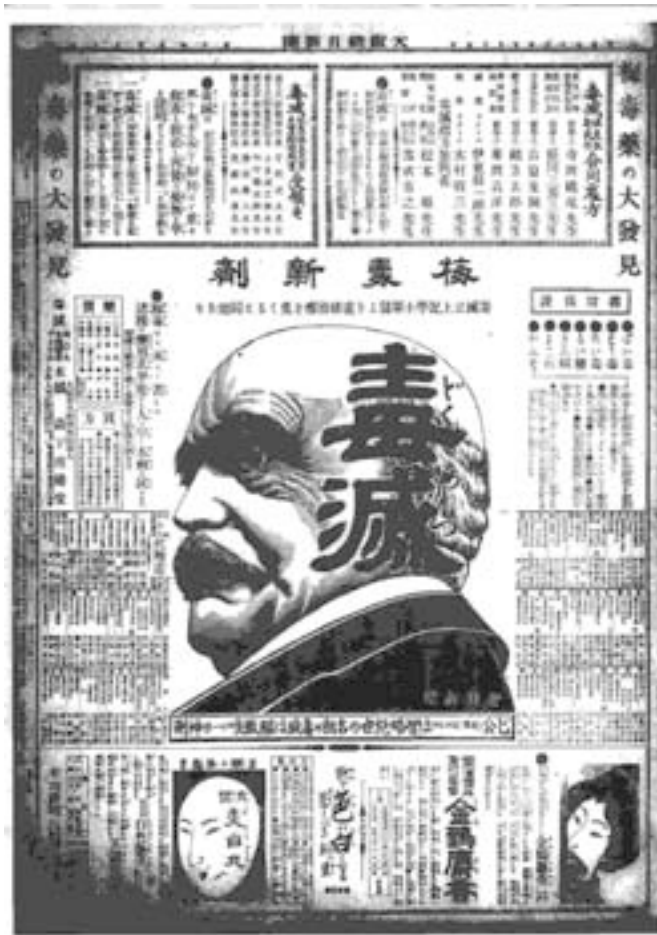
Figure 7. Dokumetsu newspaper advertisement, 1900.

used to draw attention to two important pieces of “text” in this textually dense ad. The one on the right lists in bullet fashion the names and institutional affiliations (with prestigious universities and hospitals) of those jointly described as responsible for creating the formula for the new drug, each of whom is named as a “doctor of philosophy” ( hakase ) and a “professor” ( sensei ). The framed text