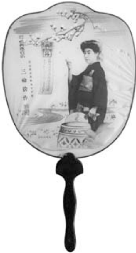
Figure 4. Fan with Jintan advertisement (Nojiri, Kusuri kōkoku , 67). Used with permission.