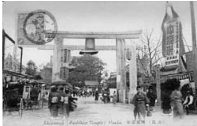
Figure 3. Postcard of Shintennōji with Chūjōtō billboard.

to be able to prevent miscarriage and difficult childbirth, features an image by Utagawa Toyokuni of a woman in courtesan attire holding the product. This use of the figure of the courtesan may well have been intended to be ironically humorous in that the courtesan, an icon of sexual pleasure, was often represented as contrasting—favorably—with the reproducing body of the wife in late Edo culture. 5