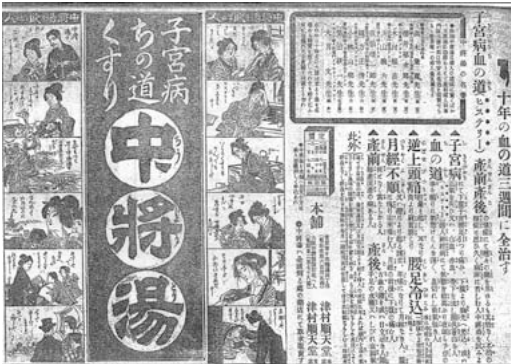
Figure 6. Chūjōtō newspaper advertisement, 1904 (Hajima, Shinbun kōkoku bijutsu taiki , 136). Used with permission.

Chūjōtō advertisements consistently depicted reproductive health as the means to female happiness. A particularly dramatic way of making this point is the design featured in a newspaper advertisement from 1904 (fig. 6), versions of which appeared frequently in the print media for decades to come. It visually contrasts the life of a woman who avails herself of Chūjōtō with that of a woman who does not. While the latter is depicted as disheveled, ill, alone, and unhappy, the consumer of Chūjōtō is represented as an attractive, industrious wife and mother, the very vision of the “good wife and wise mother” of official doctrine.