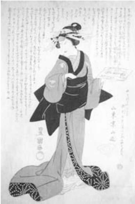
Figure 2. Anzantō handbill, late Edo (Nojiri Kayoko, ed., Kusuri kōkoku [Gifu: Naitō Kinen Kusuri Hakubutsukan, 1995], 67). Used with permission.

throughout the country. For example, Shinkyōgan, a remedy for intestinal problems, produced in Shiga Province, was prized as a souvenir by travelers on the Omi Highway. 3