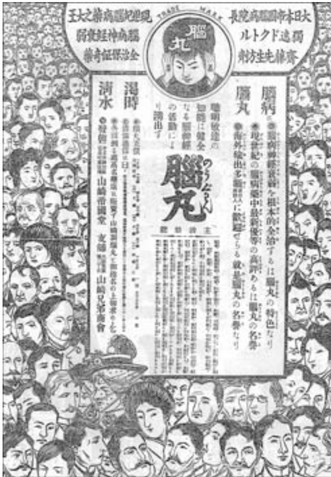
Figure 12. Nogan ad, 1906 (Hajima, Shinbun kōkoku bijutsu taikai , 229). Used with permission.

as well as an individual problem. In the 1906 Nōgan advertisement in figure 12, the trademark is situated at the top of an illustration of an immense crowd of people, largely comprising men, both Japanese and